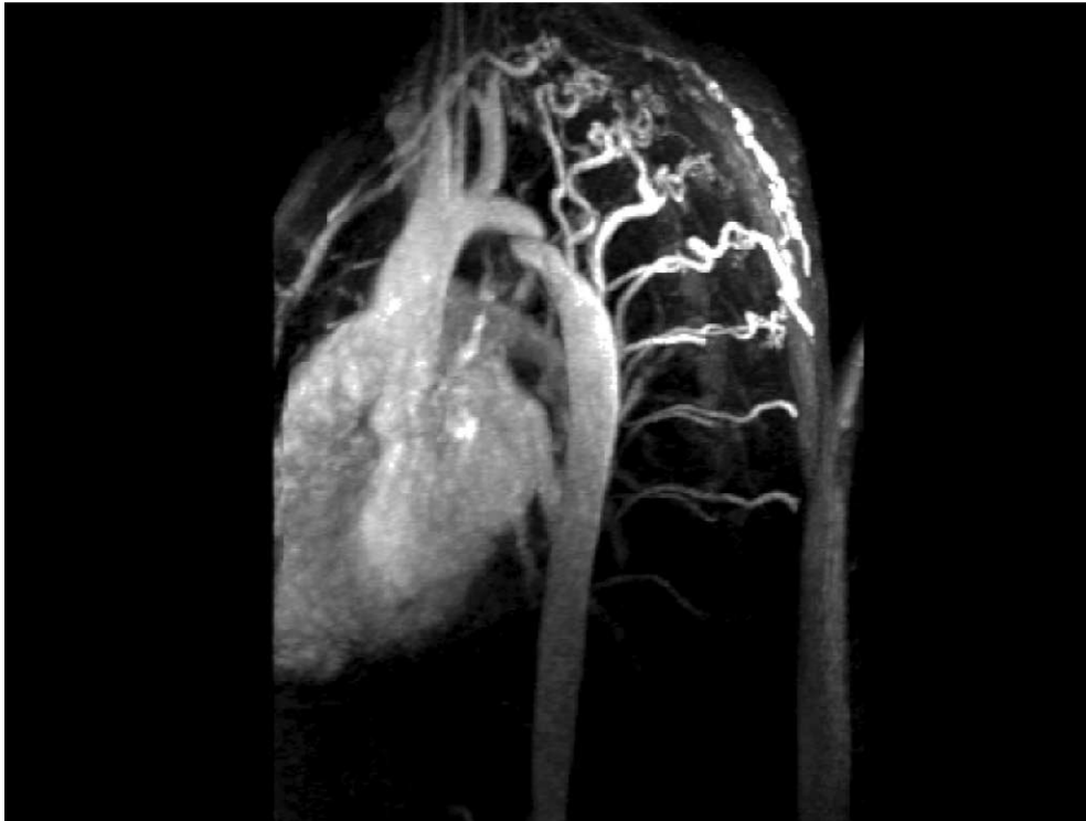
Fig. 1 Magnetic resonance angiography image of severe aortic coarctation in an adult. See section 4.6 – Imaging.

double, or Inoue balloon dilatation of pulmonary valve stenosis is usually successful, but a balloon:annulus ratio of <1.1:1 should be used to avoid pulmonary arterial damage. The role of balloon dilatation of native or postoperative aortic coarctation remains controversial. 37 Dilatation of previous patch aortoplasty carries the highest risk of aortic rupture and should be performed with surgical standby. Balloon dilatation of native aortic disease can often be achieved with excellent results, although failure to relieve stenosis (10–20%) aneurysm formation (5–10%) and restenosis (5–10%) have all been reported. 38 For this reason, there has been an increase in vogue towards balloon dilatation with simultaneous stent implantation.