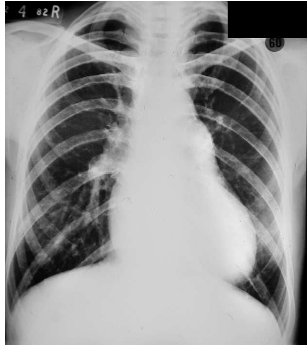
Fig. 3 Chest radiograph of a patient with Eisenmenger's syndrome. See Section 4.4 – Pulmonary Vascular Disease.

It is now possible to insert into the right ventricular outflow, a stent mounted bovine jugular venous valve, via a cardiac catheter. 43 Clinical implantation has already been performed and offers the exciting prospect of non-surgical management of