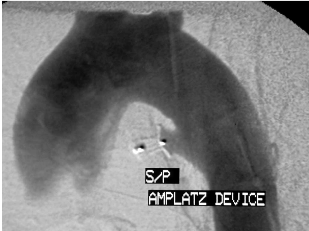
Fig. 4 Transcatheter closure of patent arterial duct using an amplatzer device. See Section 4.7 – Interventional Catheterization.

The number of mothers with complex post operative circulations (such as Fontan or Mustard/Senning) remains small and risk stratification is therefore difficult. 47,48 High-risk patients include those with: