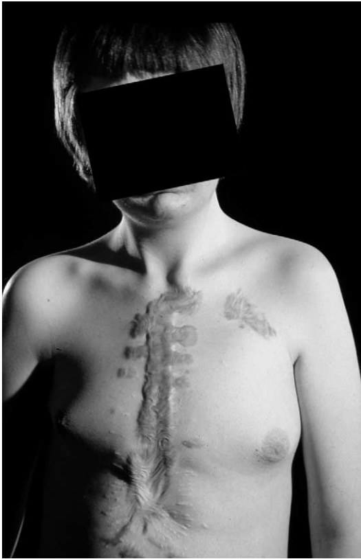
Fig. 2 Unsightly scars from multiple cardiac procedures that can cause psychosocial problems. See Section 6 – Psychosocial Issues.

patients with early onset, cryptogenic, transient ischaemia attack (TIA) or cerebrovascular accident (CVA) can be achieved with extremely low morbidity, but with little evidence base. 41 Recent trials have suggested the importance of aspirin in determining the level of risk of CVA in the presence of patent foramen ovale. 42 Treatment should be individualized and decision-making part of a multidisciplinary process, which includes a specialist neurologist.